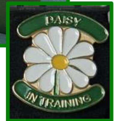
DAISY In Training Pin